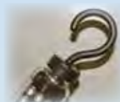
Magnetic Hook – P/N 66358HOOK