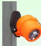
Detachable Light with Magnetic Base