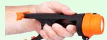
2 Beam Flashlight